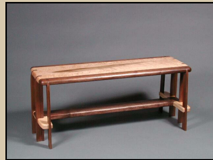
BENCH 40 X 17 X 14 Bird's eye maple + walnut