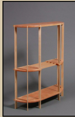
Entry Table 39H x 30W x 9D cherry + maple