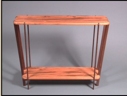
Side Table 34.5H x 42.5W x 11.5D Gonçalo alves and walnut