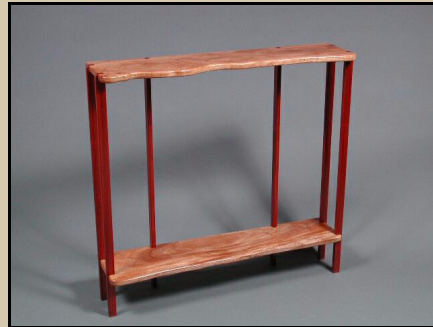
Entry Table 33H X 36.5W X 9.5D Narra and Canary wood