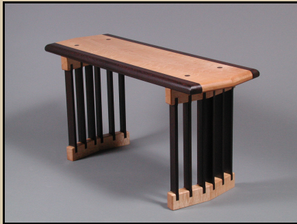
Bench 36L X 12.5W X 18.5"H Bird's eye maple + wenge