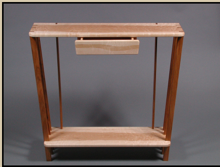
Entry table 39H x 40W x 10D Bird's eye maple + teak