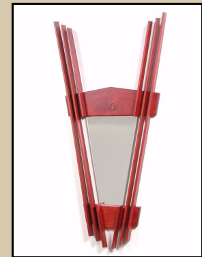
Mirror 18 X 36" Bloodwood